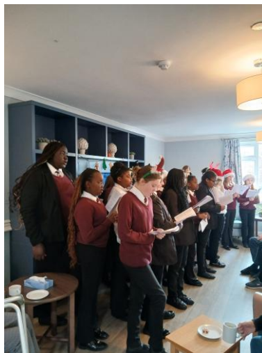
The school choir performing at the Awards Evening and carol singing at Riverwell Beck