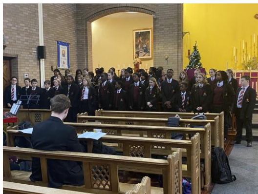
Woodwind ensemble and Year 7 Performing at the Carol Service